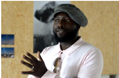
Bonaventure Soh Bejeng Ndikung